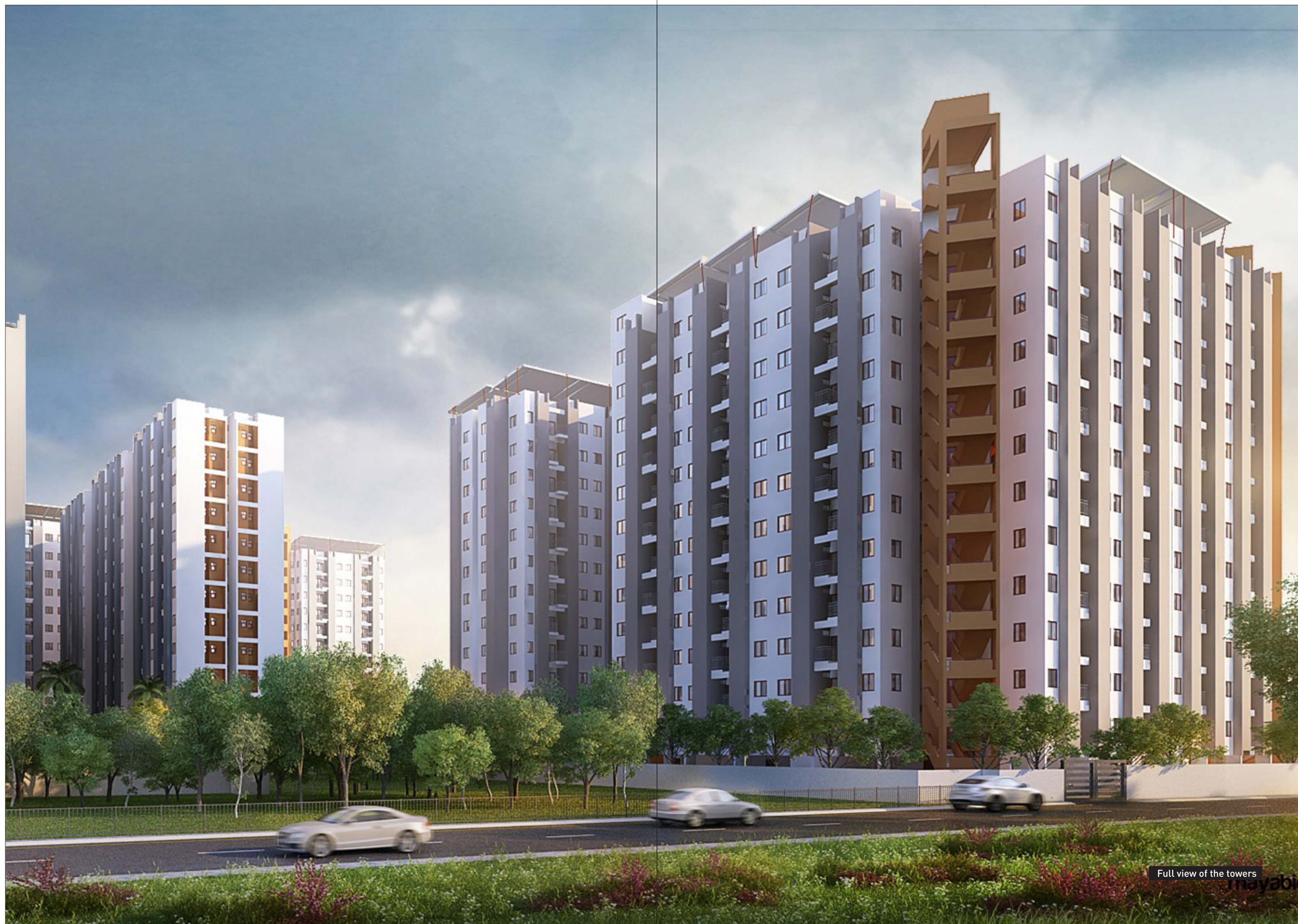
Full view of the towers